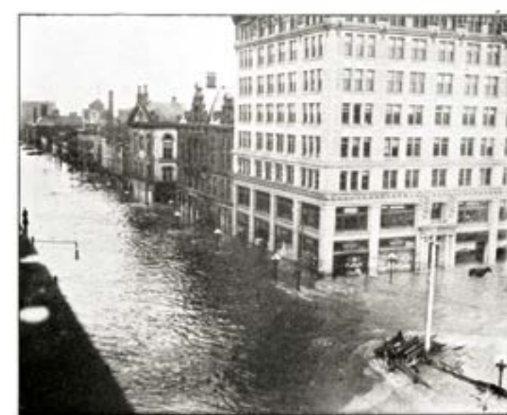
When flood was highest in heart of city—Looking east on High Street, Hamilton.