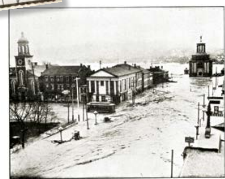
When flood was highest—Looking down High Street toward Memorial Monument, Hamilton.